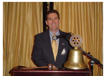
Senator Jim DeMint speaks to Rotary (Right)